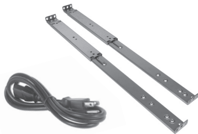
Additional QMS 1000 items