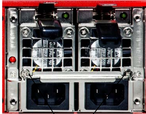
Holding bracket screws